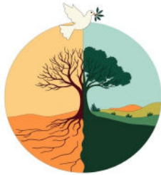
Garden of Peace Isaiah 32:14-18

Throughout the months and years, the hopes and actions that lie ahead,