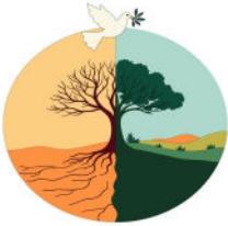
Garden of Peace Isaiah 32:14-18

SEPTEMBER 21ST 2025 – 25TH SUNDAY IN ORDINARY TIME