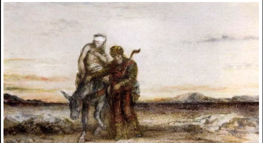
Good Samaritan by Gustave Moreau 1851

Prayer cards & leaflets are available at the church door.