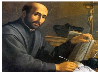
St Francis de Sales, patron saint of Journalists, faith-writer