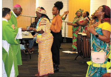
Six times judged Australasia's leading Catholic newspaper

Prayer and humility essential: Nuncio - p16