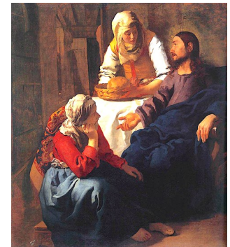
Christ in the House of Martha and Mary, Johannes Vermeer, 1655