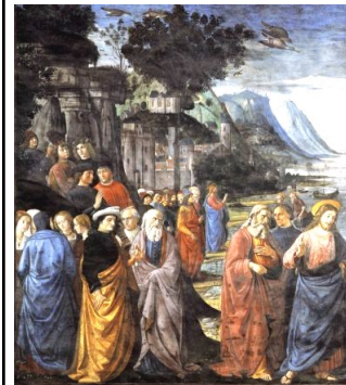
Calling of the Apostles, Domenico Ghirlandaio, 1481-

As this week's Epistle tells us, the call of Jesus shatters the yoke of every servitude, sets us free from the rituals of the old Law, shows us the Law's fulfilment in the following of Jesus, in serving one another through love.